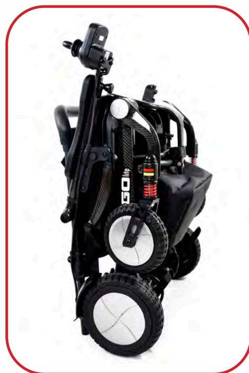
iGO Carbon Fibre folded dimensions: 31 (L) x 61 (W) x 72 (H) cm