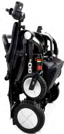
iGO Carbon Fibre (folded configuration)

OFFERING LIGHTWEIGHT CONVENIENCE - JUST FOLD AND GO!