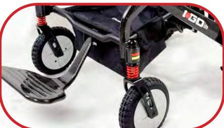
Comfortable front suspension