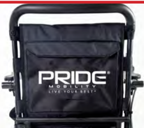
Convenient storage pouch